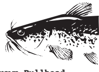
Brown Bullhead (Ameiurus nebulosus) aka: good eatin'