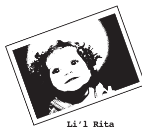
Li'l Rita 1987

Hot or Cold Cereal with juice or milk $4.99