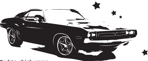
Rock’s chick wagon